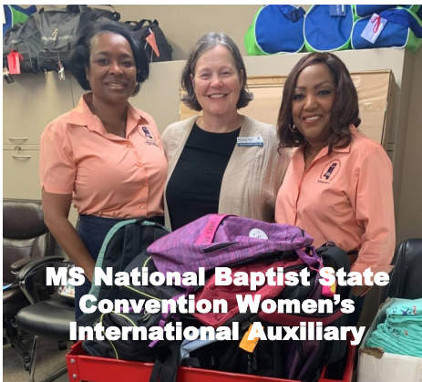
MS National Baptist State Convention Women's International Auxiliary

June 9, Jackson County CASA would like to thank the Mississippi National Baptist State Convention Women's International Auxiliary for their extremely kind donation of backpacks and school supplies on June 8 th for our children in need for the upcoming school year. It takes a village and your kind support will surely lighten the burden for numerous children. We thank you from the bottom of our hearts.