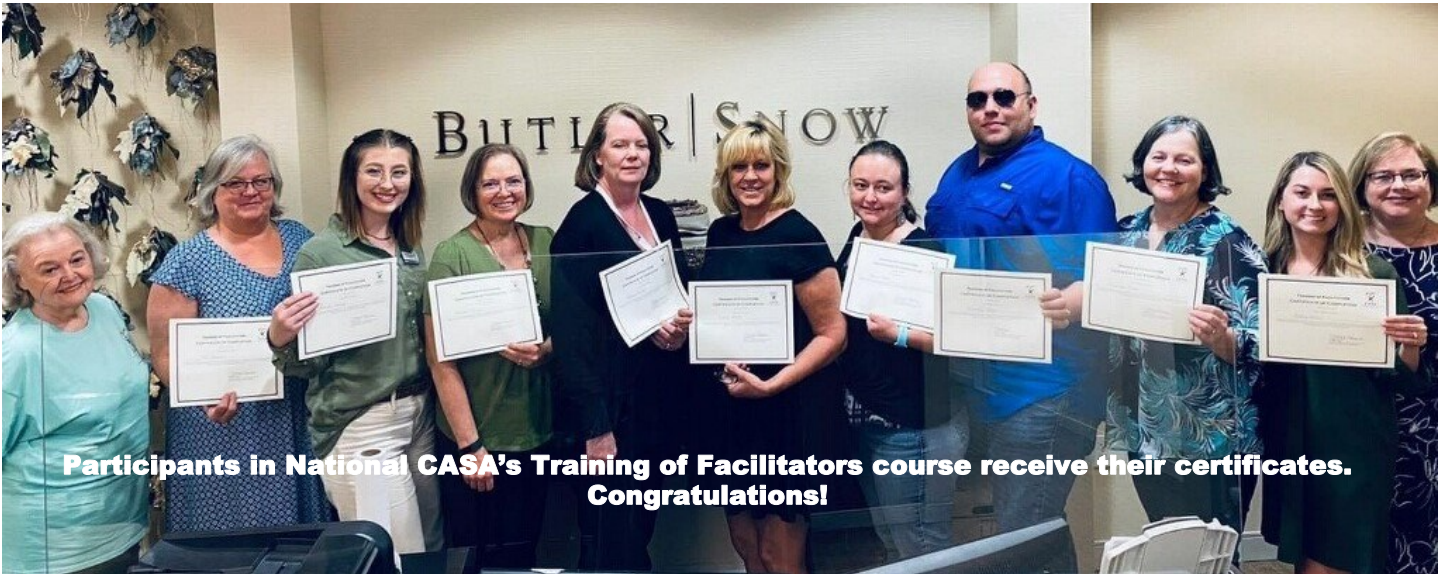
Participants in National CASA's Training of Facilitators course receive their certificates. Congratulations!