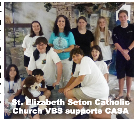
St. Elizabeth Seton Catholic Church VBS supports CASA