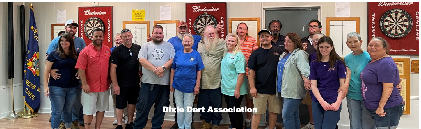
Dixie Dart Association