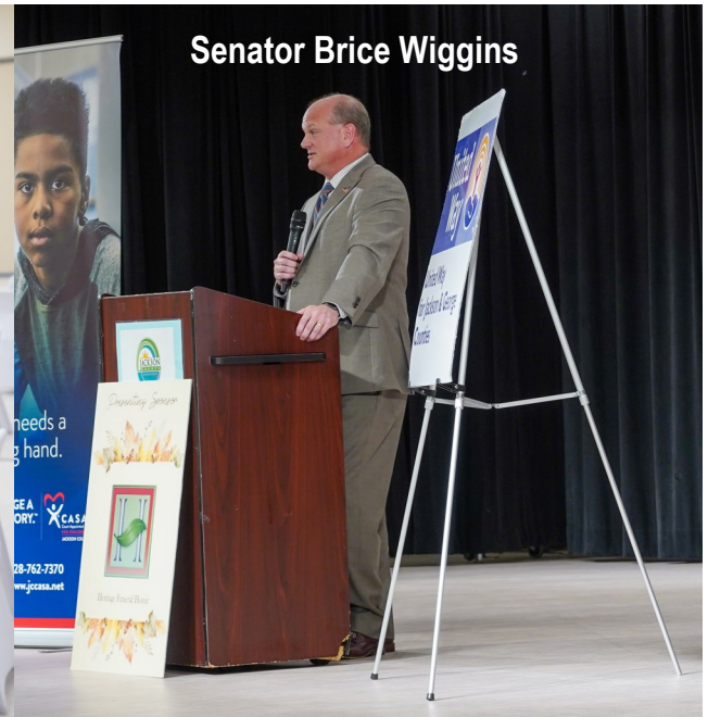
Senator Brice Wiggins