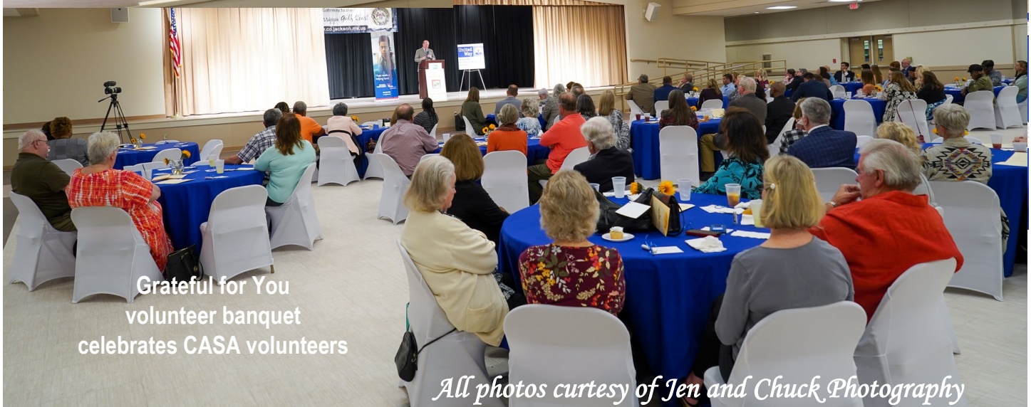
Grateful for You volunteer banquet celebrates CASA volunteers