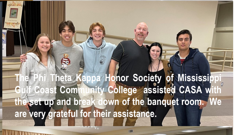
The Phi Theta Kappa Honor Society of Mississippi Gulf Coast Community College assisted CASA with the set up and break down of the banquet room. We are very grateful for their assistance.