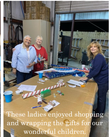
These ladies enjoyed shopping and wrapping the gifts for our wonderful children.