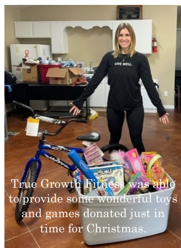
True Growth Fitness was able to provide some wonderful toys and games donated just in time for Christmas.