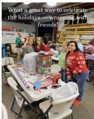
What a great way to celebrate the holidays — wrapping with friends!