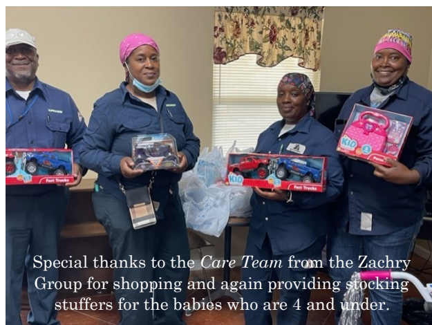
Special thanks to the Care Team from the Zachry Group for shopping and again providing stocking stuffers for the babies who are 4 and under.