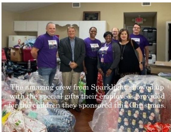
The amazing crew from Sparklight showed up with the special gifts their employees provided for the children they sponsored this Christmas.