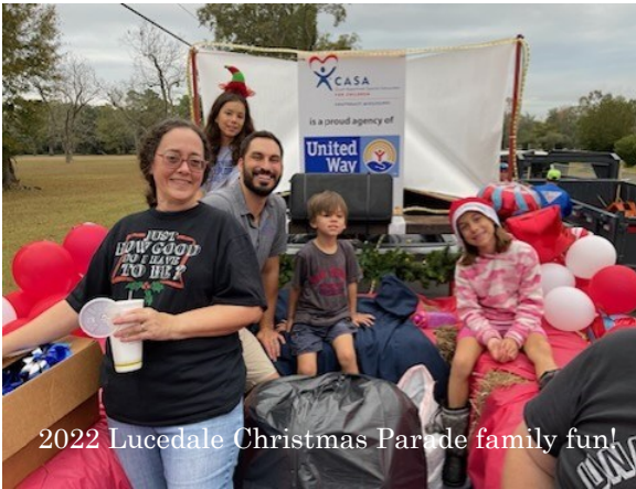
2022 Lucedale Christmas Parade family fun!