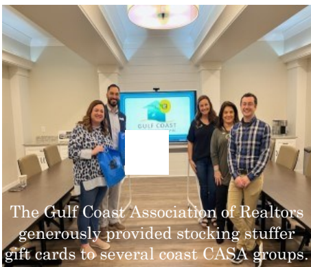
The Gulf Coast Association of Realtors generously provided stocking stuffer gift cards to several coast CASA groups.