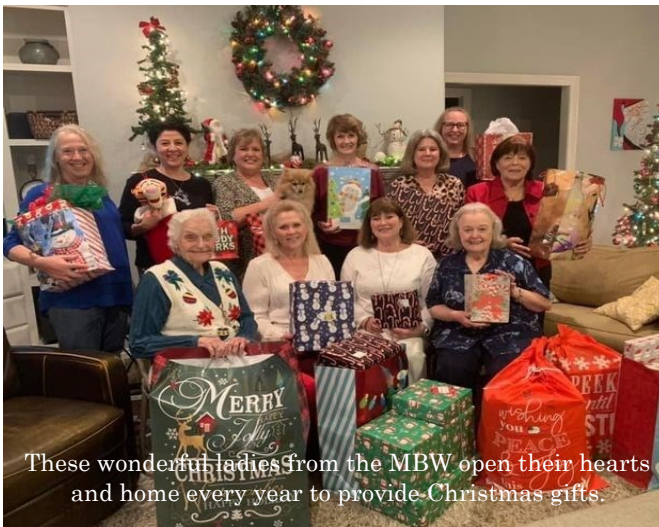
These wonderful ladies from the MBW open their hearts and home every year to provide Christmas gifts.