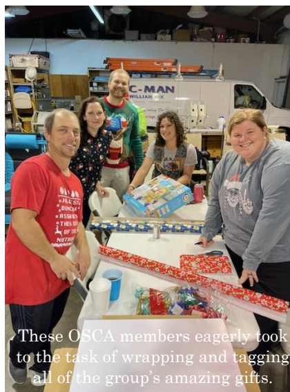
These OSCA members eagerly took to the task of wrapping and tagging all of the group's amazing gifts.