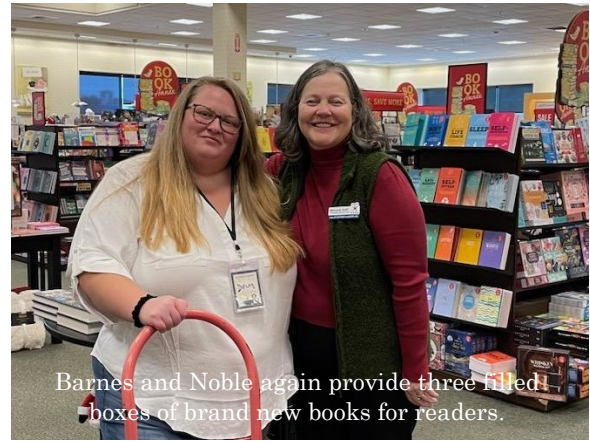
Barnes and Noble again provide three filled boxes of brand new books for readers.