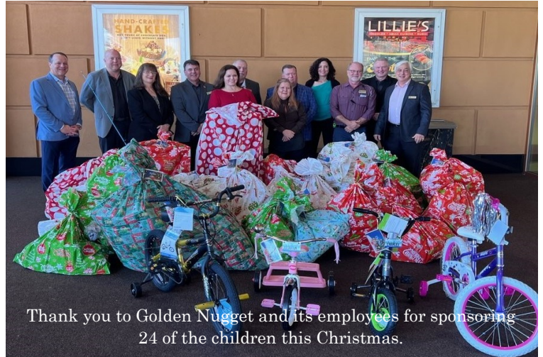
Thank you to Golden Nugget and its employees for sponsoring 24 of the children this Christmas.