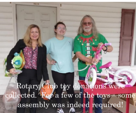
Rotary Club toy donations were collected. For a few of the toys—some assembly was indeed required!