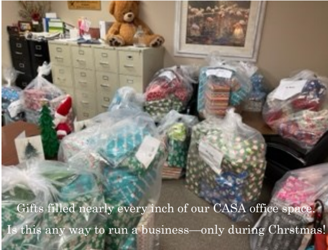
Gifts filled nearly every inch of our CASA office space. Is this any way to run a business—only during Christmas!