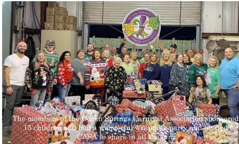
The members of the Ocean Springs Carnival Association sponsored 15 children and had a wonderful wrapping party and invited CASA to share in all the fun.