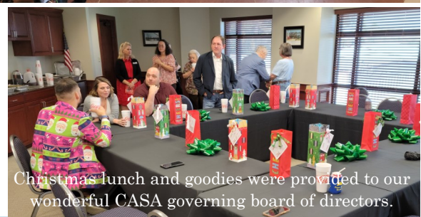
Christmas lunch and goodies were provided to our wonderful CASA governing board of directors.