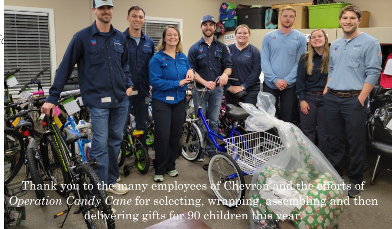
Thank you to the many employees of Chevron and the efforts of Operation Candy Cane for selecting, wrapping, assembling and then delivering gifts for 90 children this year