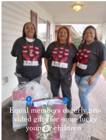
Equal members eagerly provided gifts for some lucky younger children.