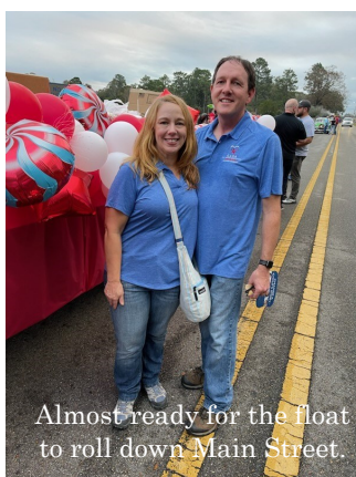
Almost ready for the float to roll down Main Street.