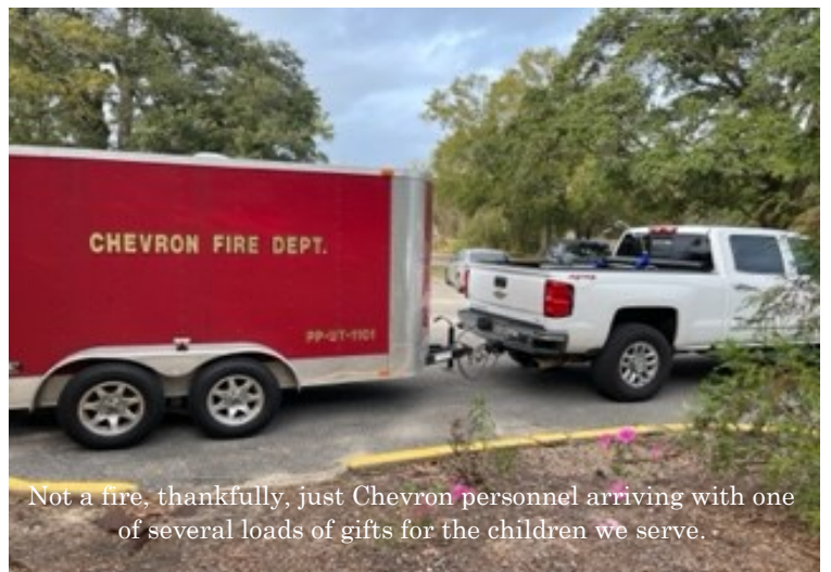
Not a fire, thankfully, just Chevron personnel arriving with one of several loads of gifts for the children we serve.