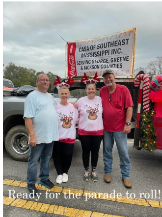
Ready for the parade to roll!