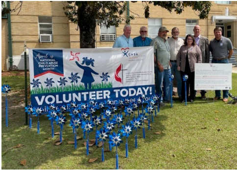
Elected officials from Greene County pose beside the completed awareness display designed to encourage community members to volunteer to serve as CASA advocates.