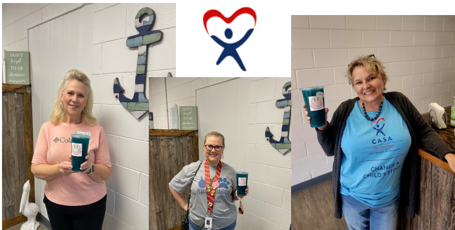
From April 14–21, sixteen nutrition drink stores participated in a fundraiser in which a portion of their proceeds was donated to aid in recruiting and training additional CASA volunteers. This was also a great way to spread the word about child abuse prevention with the feature drink, Blue Hope , and support small local businesses. Thank you to all the patrons who sampled the tea and made cash donations when you dropped in to shop these stores.