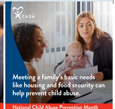
National Child Abuse Prevention Month

Meeting a family's basic needs like housing and food security can help prevent child abuse.