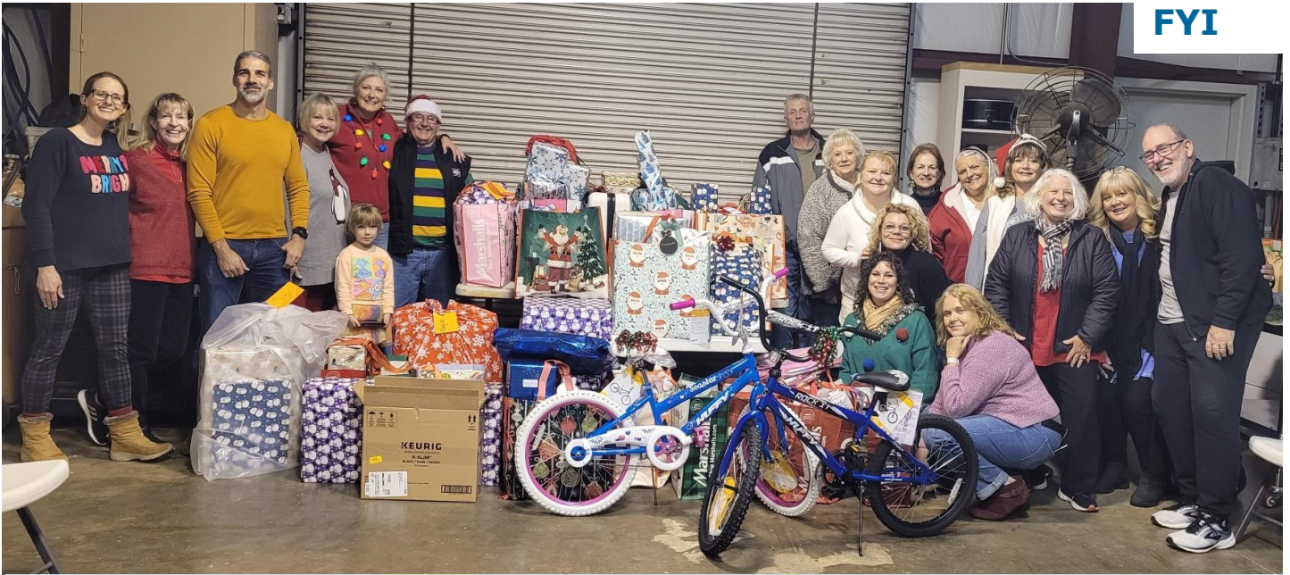
Shown above: Members of the Ocean Springs Carnival Association at the December 2024 wrapping party.