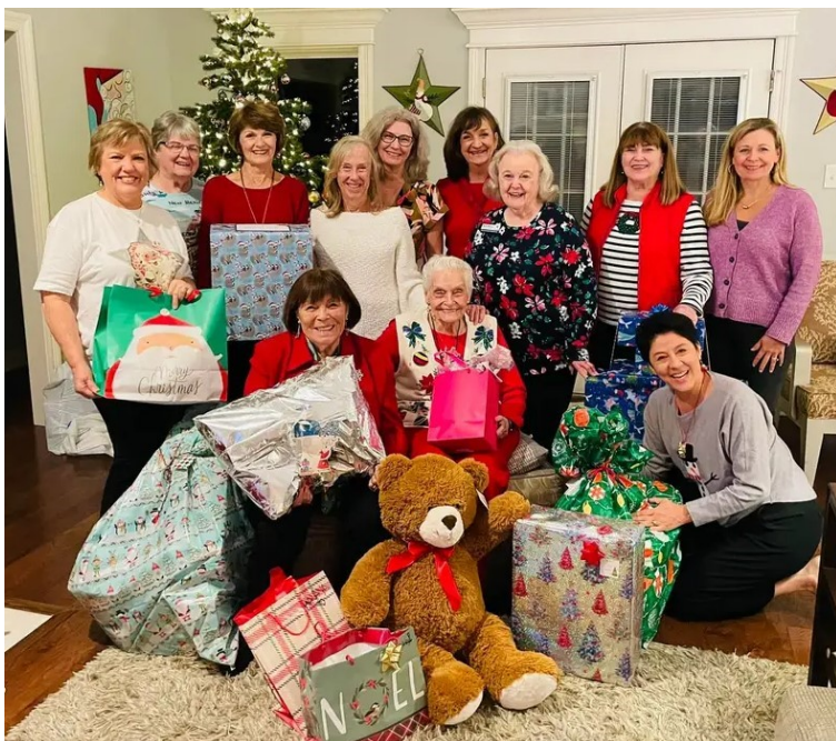
Shown below members of OSCA at their annual CASA wrapping party where gifts for the 20 children they sponsored were prepared for pick up and delivery. This is always a fun evening for everyone involved. Members enjoy the fellowship while helping provide gifts for deserving kids.